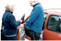
Who I would like to support me