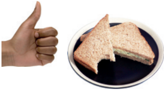
Food I like