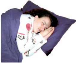
My sleeping pattern